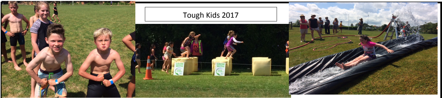
Tough Kids 2017